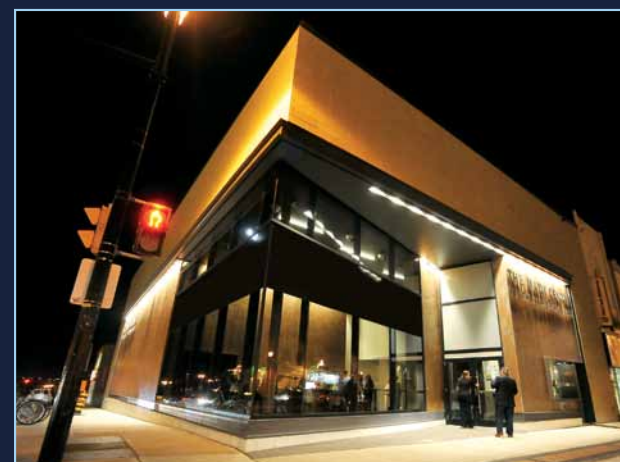
Mady Centre for the Performing Arts, 1 Dunlop St. W., Barrie